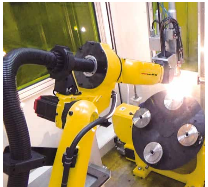
FIBER LASER welding