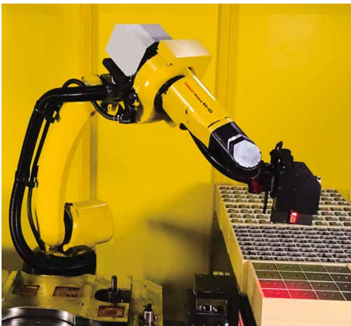
Handling of sheet metal parts